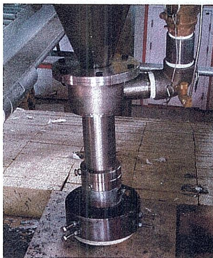
▲ Fig 1. A C-Burner machine, used to melt waste glass fibre cullet before passing it into a batch melting furnace.

The transfer of energy from the flame to the small particles of glass cullet is almost 100% efficient. The release of thermal energy by this burner directly into the glass cullet while passing